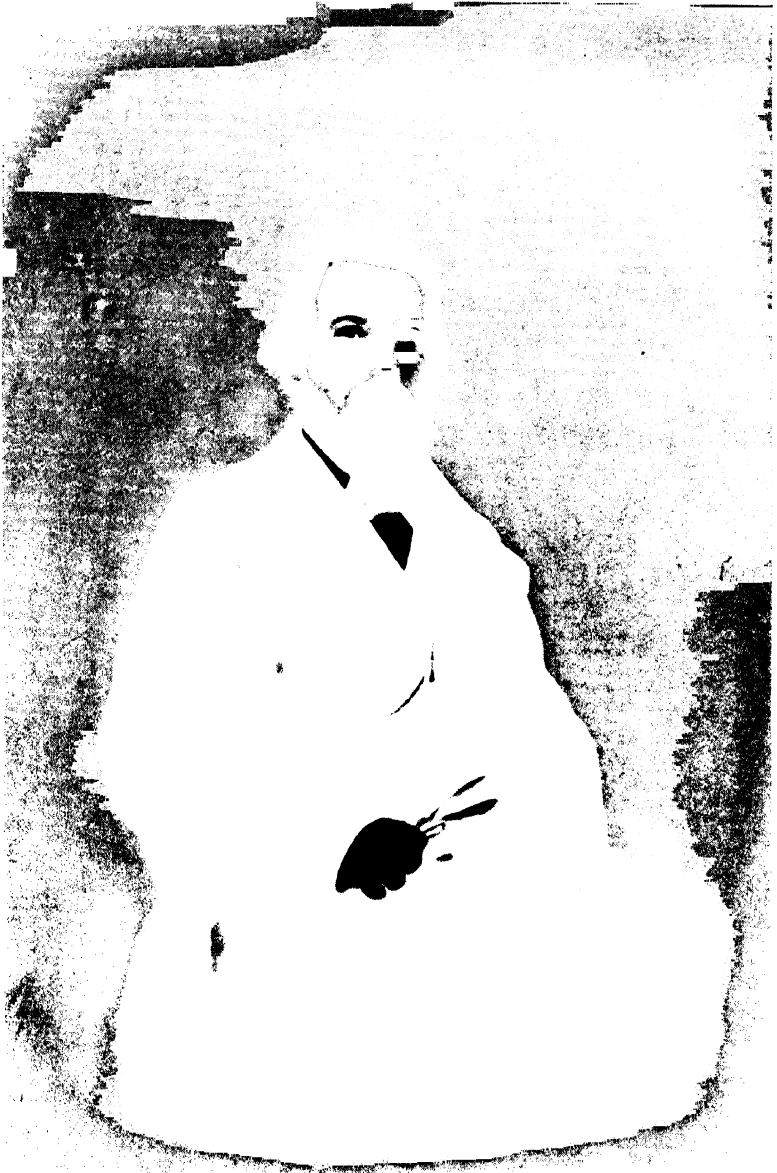
FRIEDRICH ENGELS, THE MANCHESTER MILL-OWNER.