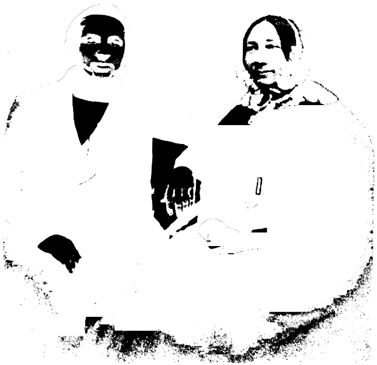
THE PARENTS OF FRIEDRICH ENGELS.