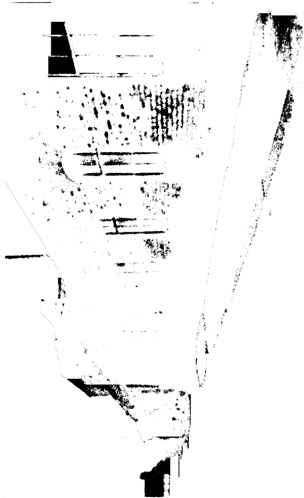
THE MILL IN MANCHESTER -- THE SECTION TO THE RIGHT OF THE PHOTO IS THE ORIGINAL MILL OF ERMEN AND ENGELS.