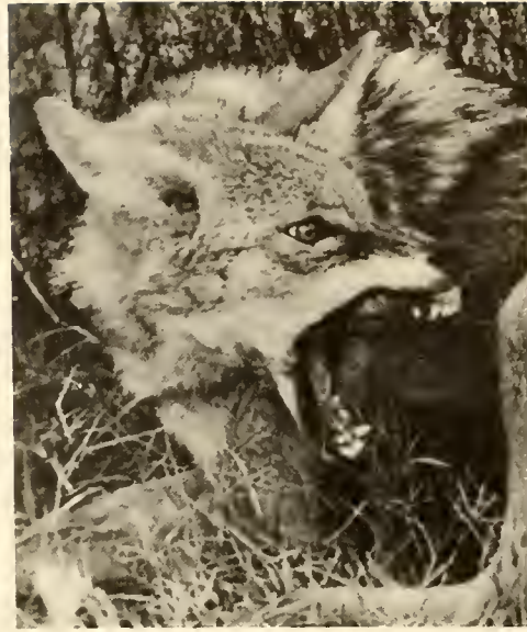
Figure 4. Red wolf (left) and coyote (right) threat behavior. A red wolf's tongue does not normally protrude as shown here.