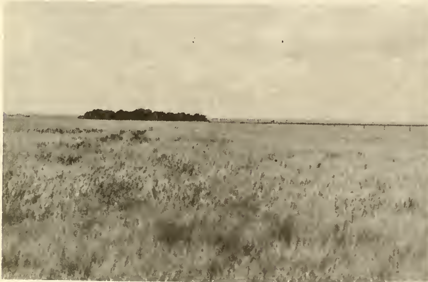
Figure 2. Photograph of coastal prairie red wolf habitat. An "island" of brush in the background.

There are also "islands" of loblolly pine ( Pinus taeda ), mixed with hardwoods. The predominant hardwood species are oaks ( Quercus ) magnolia ( Magnolia grandiflora ), and sweet gum ( Liquidambar styraciflua ). (See Figure 2.)