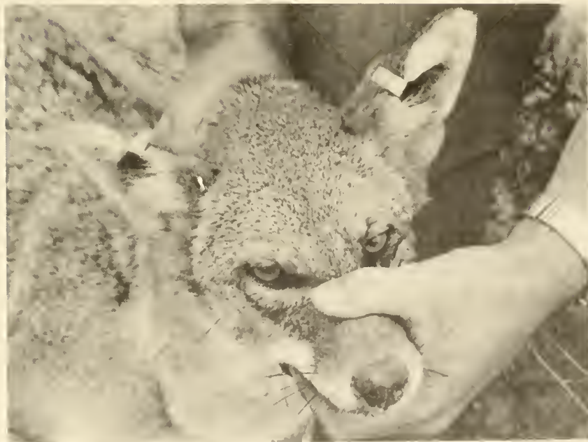
Figure 3. Photograph of a red wolf (top) and a coyote (bottom). Notice the facial markings, the length of the ears, and the width of the nose pad and muzzle. (Photos by C. J. Carley, BSFW).